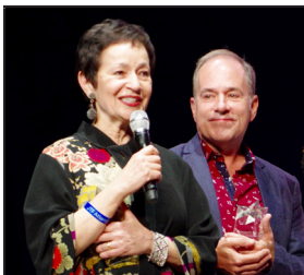
Lynn Ahrens and Stephen Flaherty