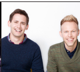
Benj Pasek and Justin Paul